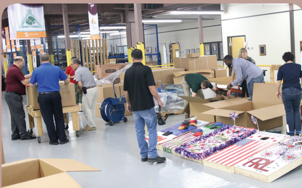
The TyRex TEAM comes together to package Mobility Carts

The TyRex Family built and sent off 63 mobility carts to those in need through MedShare, a nonprofit that recovers surplus medical supplies and equipment. Thank you to all the volunteers who donated their time by building and packing these life-changing carts.