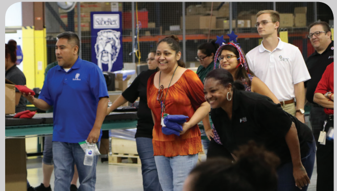
TyRex Family members compete in the bag-toss competition