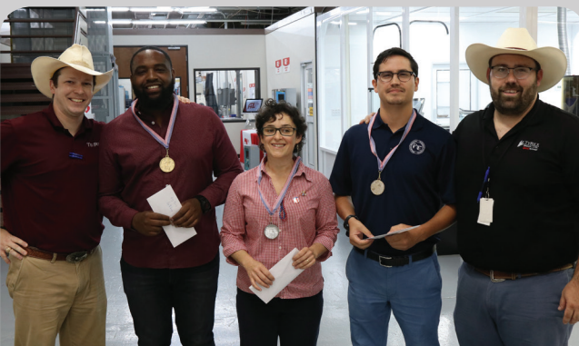
Bag-toss competition winners from the celebration