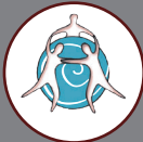
TyRex Learning Foundation