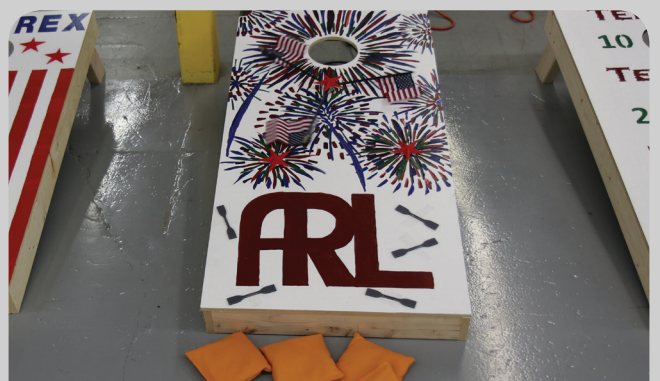
ARL wins the bag-toss board decorating contest