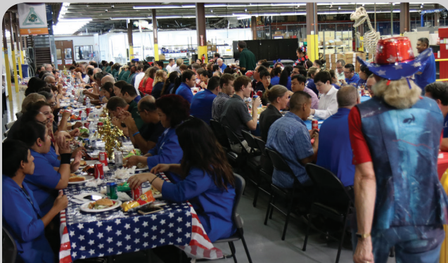
The TyRex Family gathers together to enjoy BBQ

The TyRex Family had a great time celebrating Independence Day with a bag-toss board decorating competition! All of the entries took decorating to a whole other level! Winners were announced at the TyRex Independence Day lunch where all the companies came together for great BBQ and a bag-toss competition. Coming in 3rd was iRex, while Megladon finished 2nd and ARL's board stole the show, by winning first-place honors. Thanks to everyone who participated in this friendly company competition!