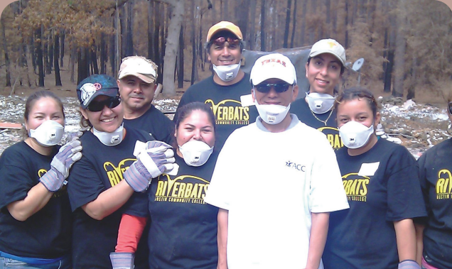
iRex Family members volunteer in Bastrop after the 2011 wildfires