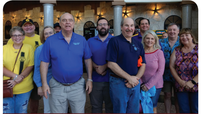
The TyRex Family enjoys a group outing to see "The Meg" movie