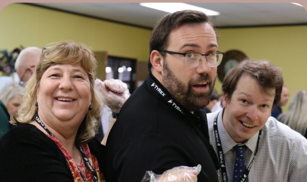
We have a lot to be thankful for at TyRex