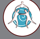
TyRex Learning Foundation