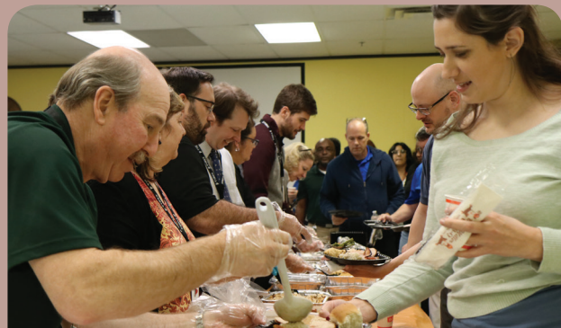
TyRex managers serve employees Thanksgiving lunch as a way of saying "Thank You"