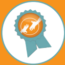
RecognizeGood ® Illuminating GOOD in Our Community