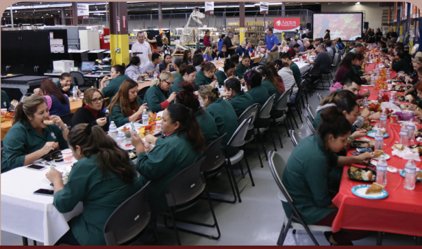
TyRex employees enjoying our Thanksgiving celebration

The TyRex Family's annual SAY THANKSgiving luncheon is a time for all of our family members to enjoy each other's company and give thanks. Gratitude is such a key part of our company culture, it's no small wonder this is one of our favorite times of year. During the event we enjoyed a delicious Thanksgiving meal and spent time together as a TyRex Family. The celebration was decorated with hundreds of RecognizeGood Thank You Notes that were given and received by members of the TyRex Family, truly demonstrating the power of gratitude.