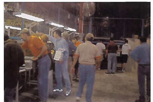
SabeRex and the Boy Scouts rebuilt computers for their community project in December. These computers were then donated to local organizations.