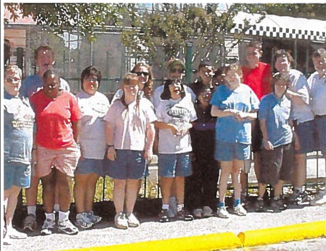
East Williamson County Special Olympics Team

We enjoy hearing from you the TyRex Technology Family. Send an email to corporate@tyrexmfg.com if you would like to identify someone or something outstanding within the TyRex family.