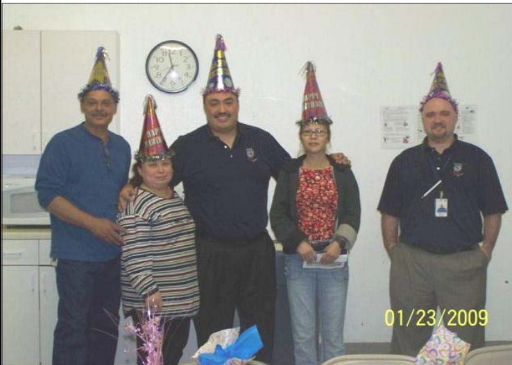
Delta celebrated the January birthdays in style.