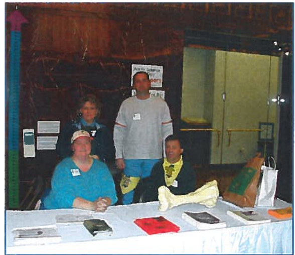
TyRex Technology Family Volunteers at the Austin Science Fair.