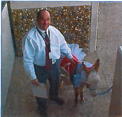
TyRex Services New Mascot