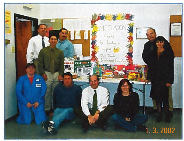
Employees gather materials and supplies to donate to Brentwood Elementary