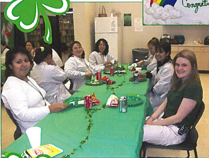
Celebrating St. Patrick's day iRex style.