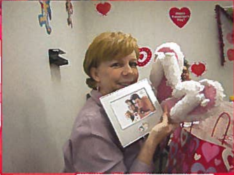
Megladon Celebrates Valentines Day