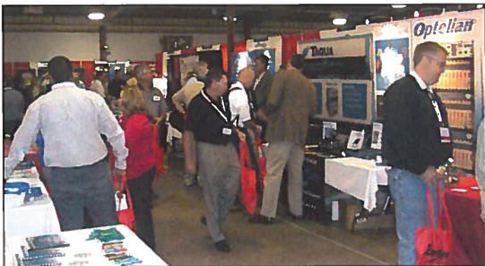
Megladon exhibited at the Telecommunications EXPO in Belton Texas in April.