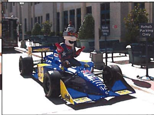
Sparky, the Texas World Speedway Mascot was also on hand for the event. Children got the opportunity to sit in the race car and have their photo take with driver Milka Duno and Sparky.