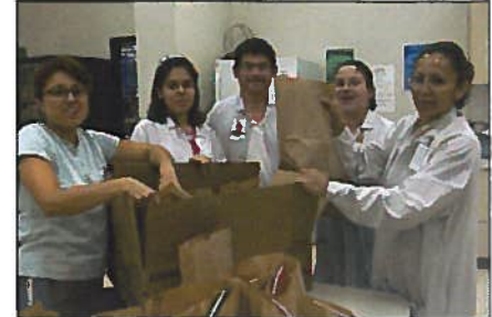
The entire iRex team participated in preparing the gift bags which included cameras for the kids to use for their photo with IndyCar driver Milka Duno.