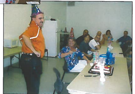
At SabeRex Delta they don't just get ice cream and cake, they get a floor show too!