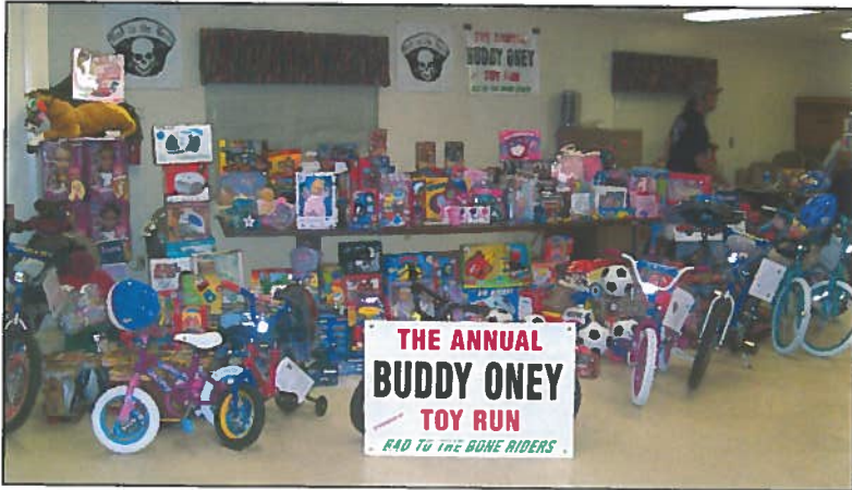
Photo left: Among the holiday activities is the annual Buddy Oney Toy Run.

Community Citizenship is one of the Diamond Disciplines that define the character of The TyRex Group of Companies. While community citizenship is a year-round effort, this community activity comes through at no time during the year more than the holiday season. Here is just some of the activities we will be involved in this season.