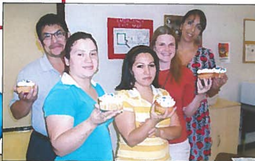
left: iRex breaks from the traditional birthday cake and celebrates July birthdays and anniversaries with cupcakes.