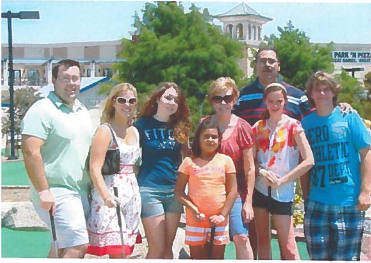
Above: Megladon employees and family members play putt-putt golf at the annual summer company picnic.