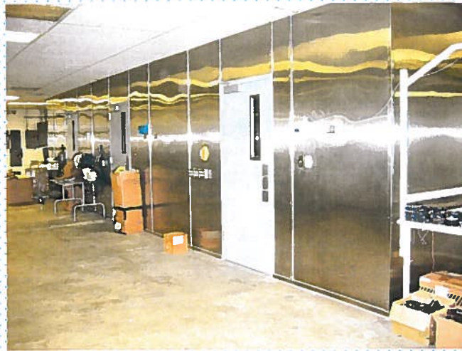
Thermal chambers at TyRex Services