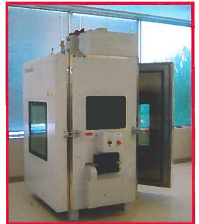
Qualmark OVS 2.5 Test Chamber

As of July of this year, TyRex Services Group Ltd. is doing business as Digital Light Innovations, or just DLi. This name change better reflects the business activities that are at the core of our company value proposition. DLi's on-going relationship with Texas Instruments' DLP (Digital Light Processing) Catalog