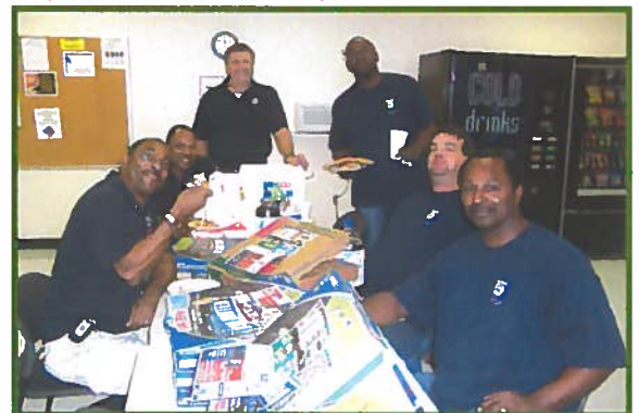
Pictured Above: Some of the SabeRex-Flextronics Team members enjoying their pizza.

In recognition of their success, SabeRex invited the Flextronics and SabeRex staff to a pizza lunch on Friday November 2, 2007.