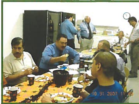
Pictured Below: The Electronics Division joined together to celebrate Halloween with a pizza luncheon.