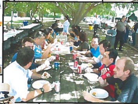
Pictured Left: Everyone enjoying eating outside.