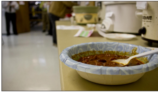
With over 20 employee entries in the chili cookoff, there could only be one winner.