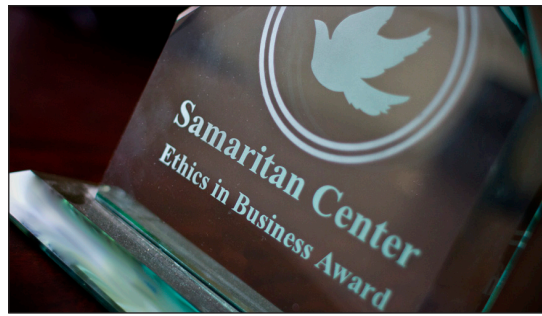
The Ethics in Business Award is given annually. TyRex won the award in 2007.