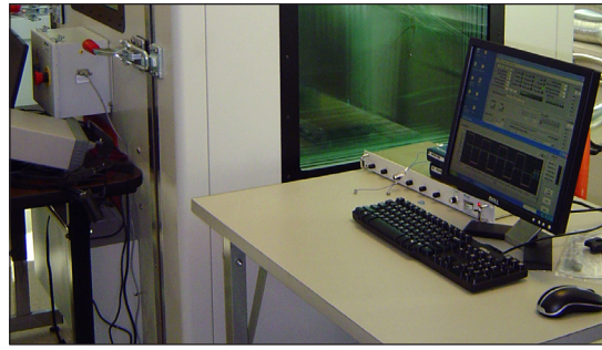
The lab is a place of deductive discovery; quality is infused by finding every flaw and methodically removing them until the product shines.

At a minimum, a reliability specification should consist of three components: a specified reliability, a time associated with the specified reliability, and a desired confidence level.