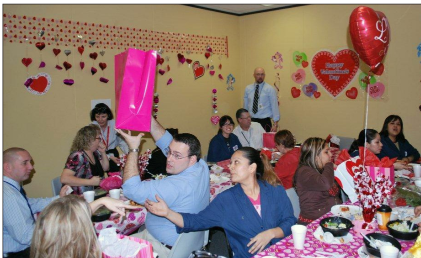
The Megladon Manufacturing Group takes care of their employees by organizing a Valentines Day Gift Exchange.