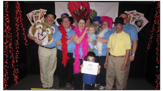
iRex employees organized a bowling team to participate in the Austin Trudy's Bol for Kids Sake fundraising event.