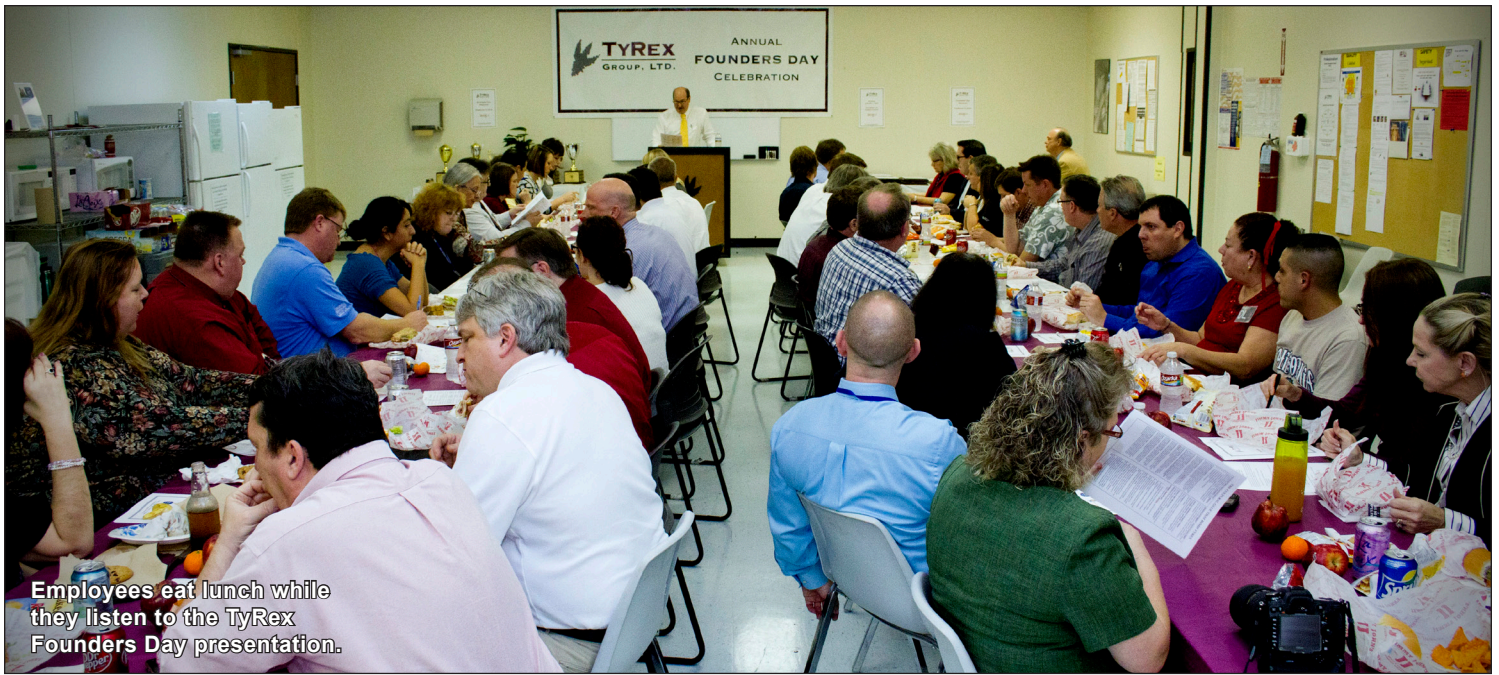
Employees eat lunch while they listen to the TyRex Founders Day presentation.