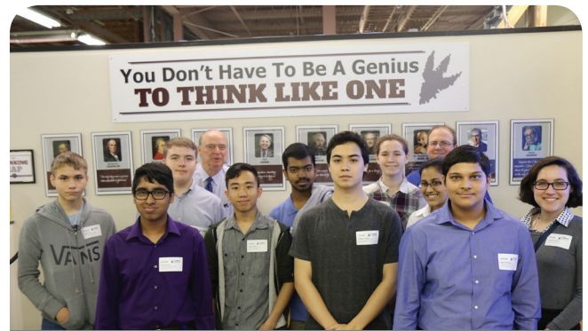
High school students join TyRex leadership for a job shadow day.