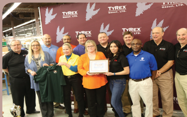
The TyRex Cost Procurement Team is honored for their hard work.