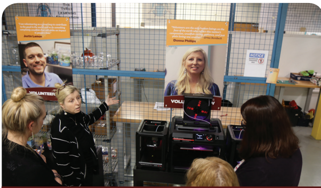
Eighteen employees have now received their 3D printing certificates.