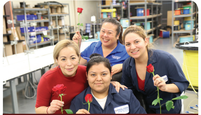
TyRex surprises the girls with roses on Valentine's Day.