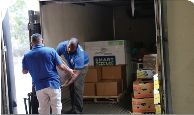
TyRex has now donated over 700lbs of food to the Central Texas Food Bank!