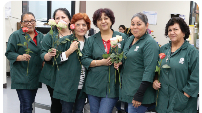
iRex employees with their Valentine's Day roses