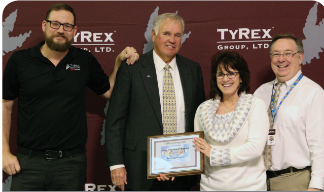
RecognizeGood receives the Circle of Business Trust Award at Founders Day