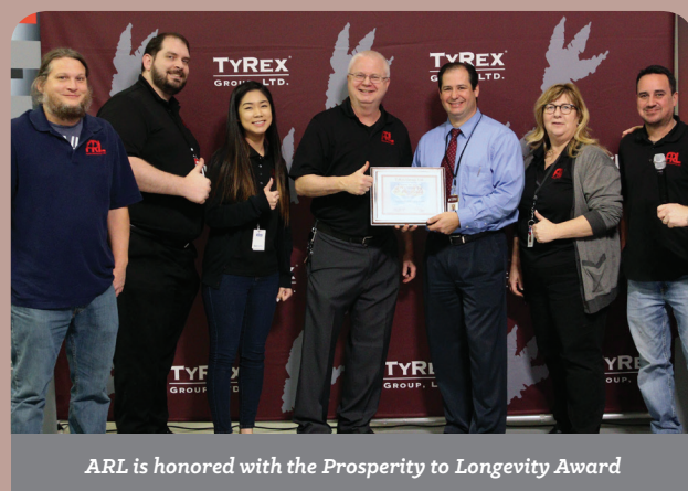
ARL is honored with the Prosperity to Longevity Award