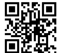
Technology Time Video