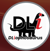
Digital Light Innovations