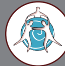
TyRex Learning Foundation