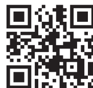
Technology Time eBook