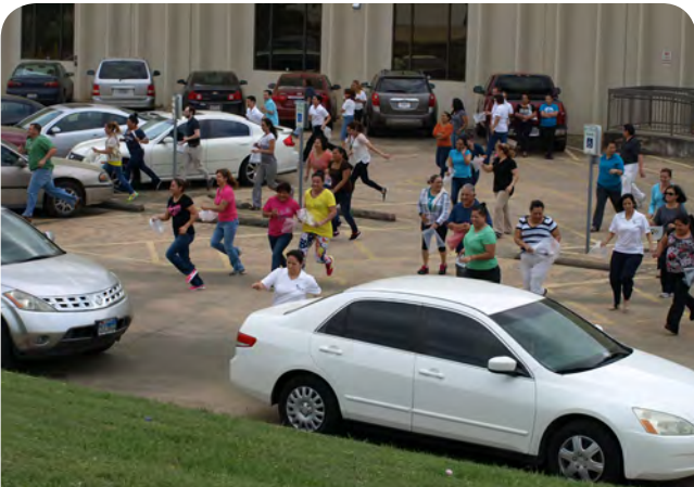
And they're off! TyRex employees sprint to find the most eggs.