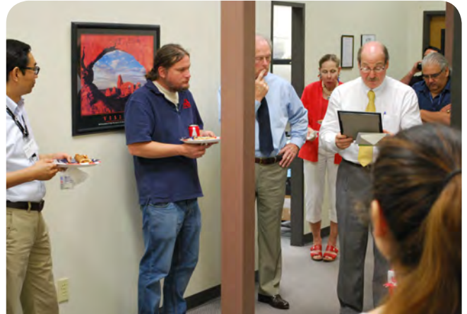
ARL celebrates a customer kudos with a pizza party.