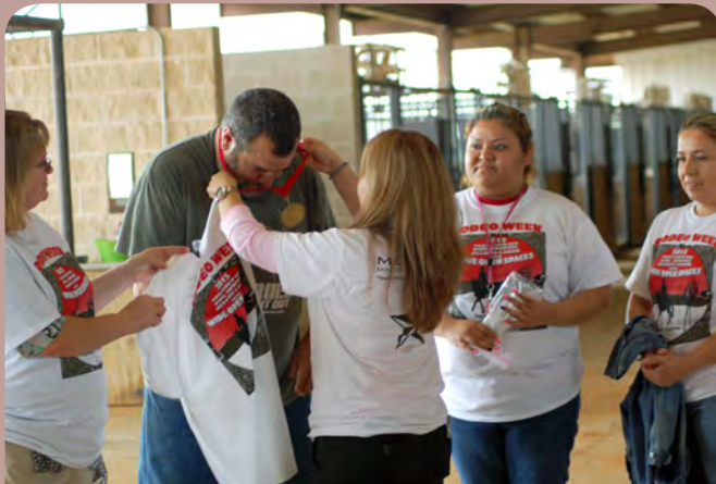
Megladon hands out medals and t-shirts to rodeo participants.