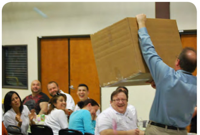
Eggs were returned as efficiently as possible.