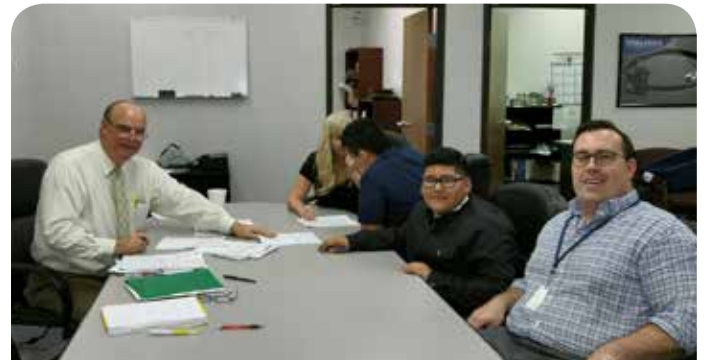
Students join in on important company meetings at Megladon.