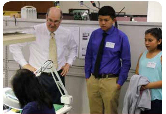
Two students learn a little about SabeRex production.