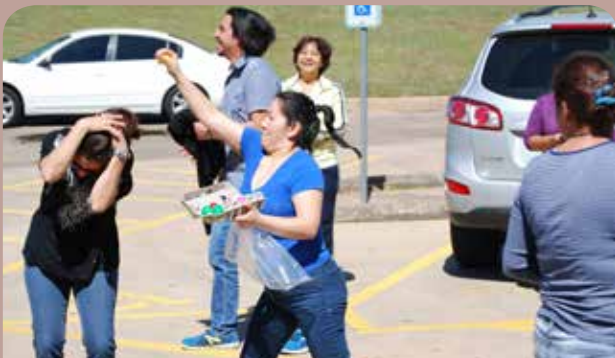
A spontaneous confetti egg fight broke out after the hunt!