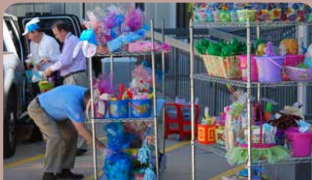
TyRex Leadership loads up the baskets for delivery to SAFE Alliance!