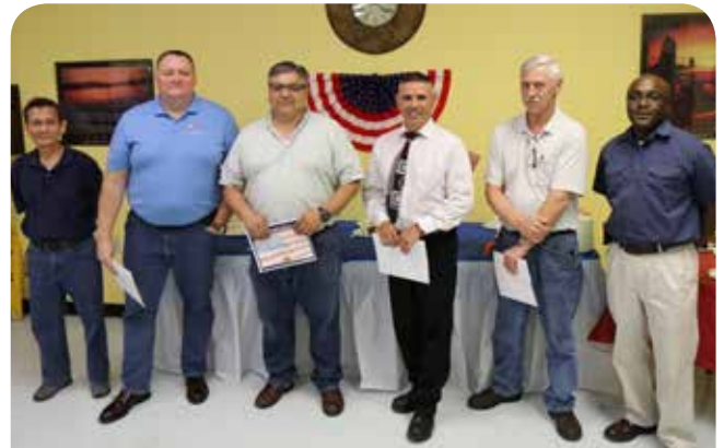
TyRex celebrates Memorial Day and thanks our military service men.