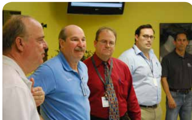
TyRex leadership thanks all employees for their hard work and support!

Follow all of the TyRex Technology Family companies on Social Media!