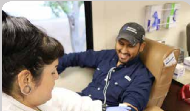
American Innovations employee helps save the lives of Central Texans.

Big thanks to American Innovations and the rest of our Technology Boulevard neighbors for joining us and The Blood and Tissue Center of Central Texas at this quarter's blood drive & donation day. A grand total of 21 donations were collected! Along with the blood donation, we also collected boxes of donation items for the Capital Area Food Bank, Goodwill Central Texas and the Austin Children's Shelter.