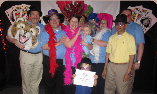
TyRex Family members volunteer at Big Brothers Big Sisters Bowl for Kids 2012