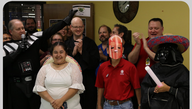
TyRex Family members compete in a Star Wars costume contest