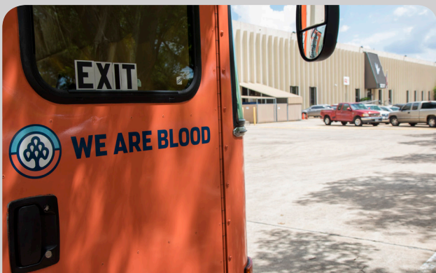
We Are Blood's Blood Bus parked outside of the TyRex facility

TyRex would like to thank all our Technology Boulevard neighbors for joining us at our second Donation Day in 2018! We had 19 donors give to We Are Blood, collected 344 lbs of donations for Goodwill Central Texas and received over 50 children's books for BookSpring!