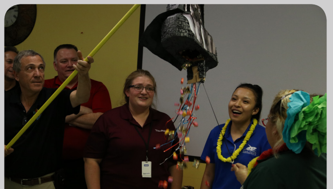
Celebrating with a festive Darth Vader piñata