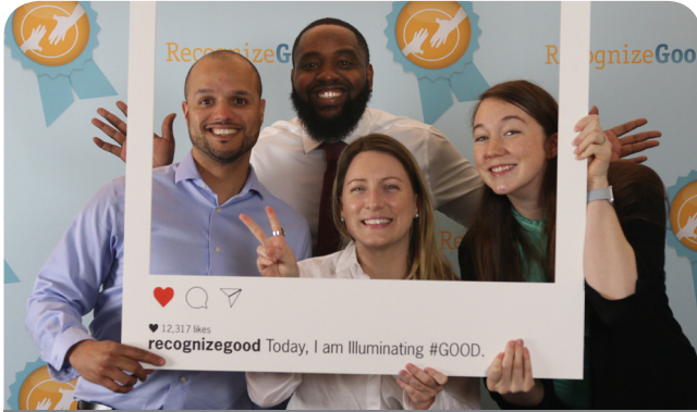
The DLI team enjoying the photo booth at the Ethics in Business Luncheon