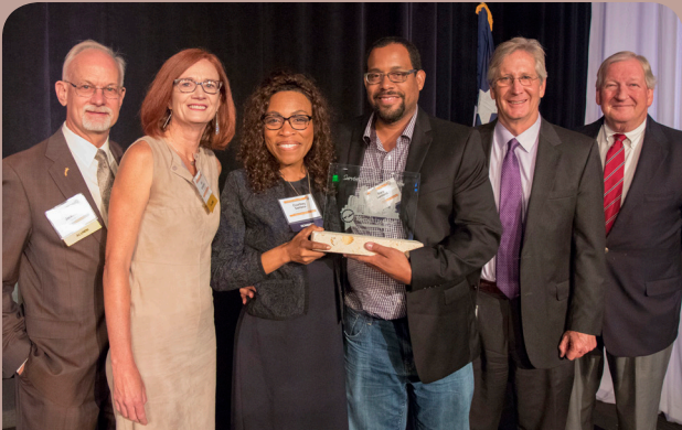
Survive2Thrive receiving the 2018 Nonprofit Award