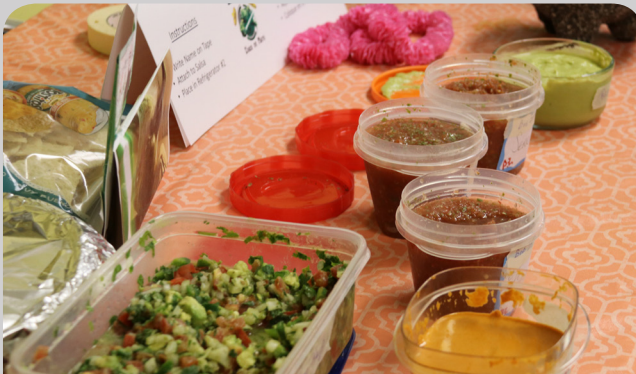
Salsa contest entries from the TyRex Family