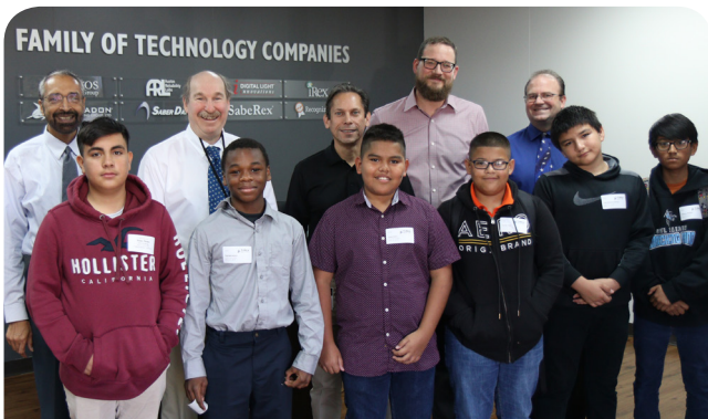
The TyRex Family hosts middle school students for CEO For a Day