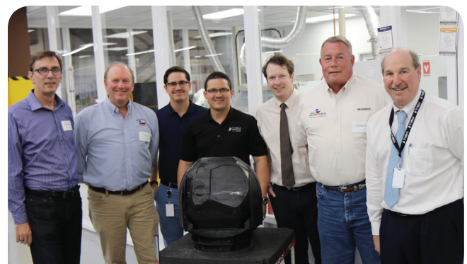
TekRex / SabeRex teams pose with representatives from the Texas Military Forces Museum at Camp Mabry alongside their unique project.