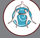
TyRex Learning Foundation