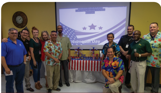
Honoring many of our veterans at our Memorial Day celebration in May.