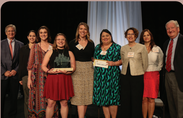
Kerbey Lane Cafe receiving the 2019 Large Business Award