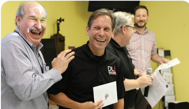
When you miss our Birthday and Anniversary party, you never know who might step in to pick up your envelope!