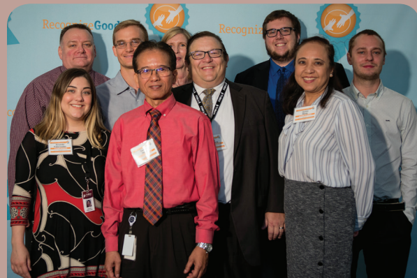
iRex staff supporting Ethics in Business