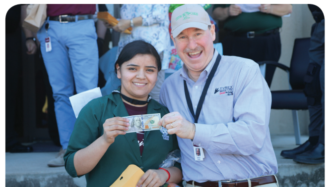
Cold hard cash rewards in our annual Easter Egg Hunt!