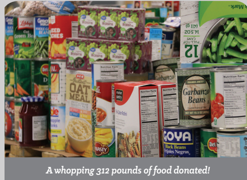
A whopping 312 pounds of food donated!