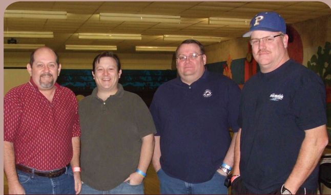
The iRex team from 10 years ago, waiting to bowl a few strikes.