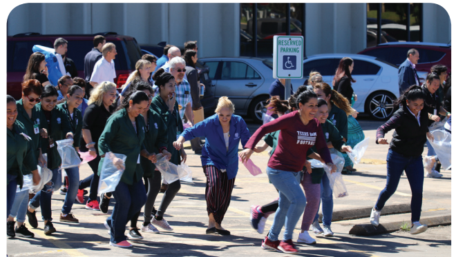
Off to the races! Getting a running start to locate this year's golden eggs.