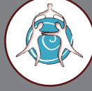
TyRex Learning Foundation