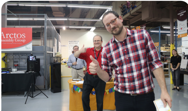
Thumbs up for social distancing!