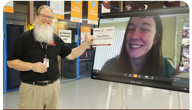
Celebrating 3D Printing success virtually!