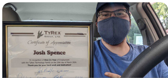
Spreading Tyrex Family love to our employees working from home!