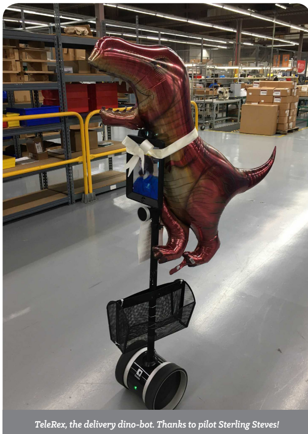
TeleRex, the delivery dino-bot. Thanks to pilot Sterling Steves!

PLEASE READ "TYREX CORONAVIRUS PLAN(S)" ON PAGE 3