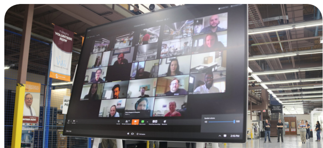
We can't wait to reunite with everyone!