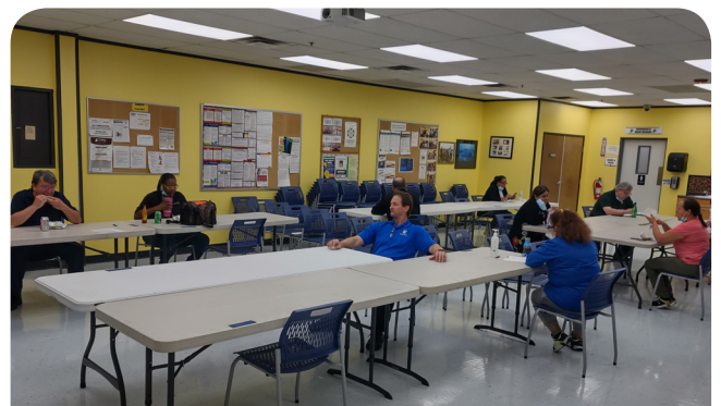
Staff enjoying breakfast tacos on Cinco de Mayo!