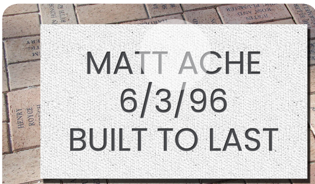
TyRex gifted Matt Ache with a brick for 25yrs of service