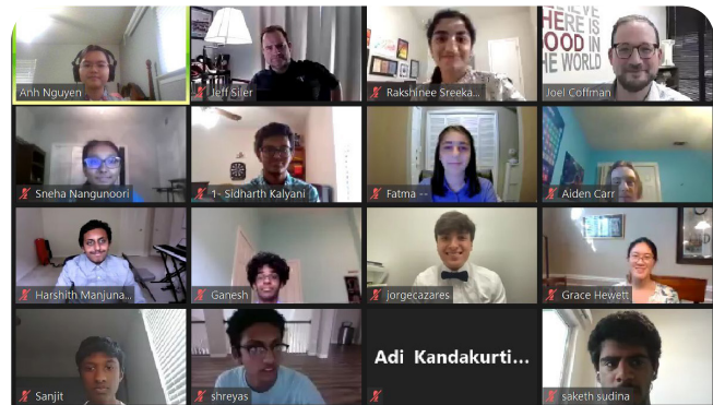
Kudos to the initiative showed by Westwood Tech Starters club!