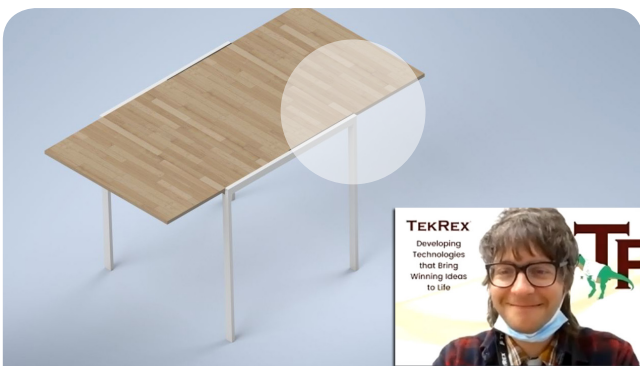
Rob Sparks checking out foldable furniture designs by students.