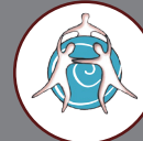
TyRex Learning Foundation