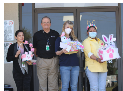
Basket decoration contest winners