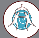
TyRex Learning Foundation