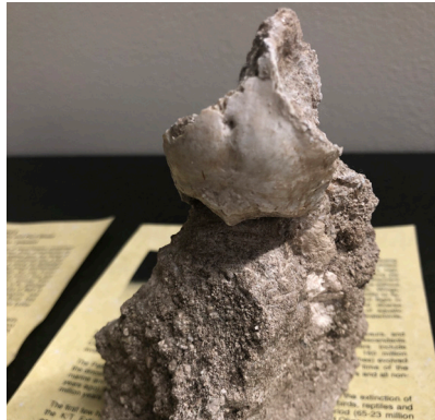
Bird Cranium in Matrix