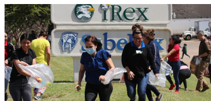
TyRex Family Members hunting eggs