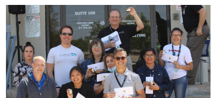
Golden Egg Winners