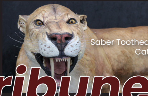
Saber Toothed Cat