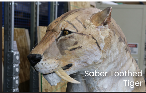
Saber Toothed Tiger