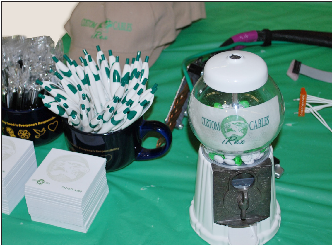
Just some of the iRex goodies and products on display at the CTEA Tech Forum and Expo

With over 18 years of cumulative business knowledge and hundreds of years combined experience, iRex's Custom Cable Group has become the premier engineering and design support center for cable in the state of Texas and select parts of the United States. The Custom Cable Group has the experience, knowledge and technical capabilities to assist and support your company's engineering and product design staff in the area of electronics cable connectivity.