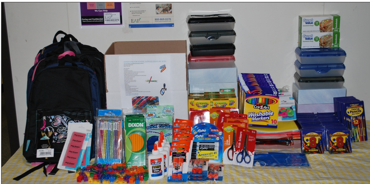
Megladon collected a great deal of back to school supplies to be donated to local kids

iRex, SabeRex and TyRex, and are greatly appreciated. There are too many people involved in this program to thank, so on behalf of Gause Elementary, thank you all for your generosity and commitment to the education of the youth in this beautiful community we call home.