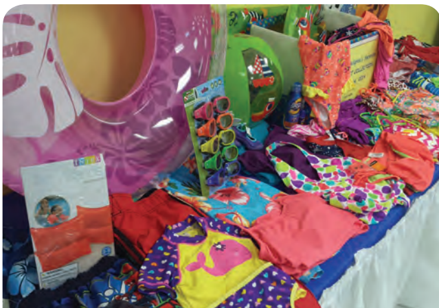
The results of our Swimsuit Drive for the Austin Children's Shelter.