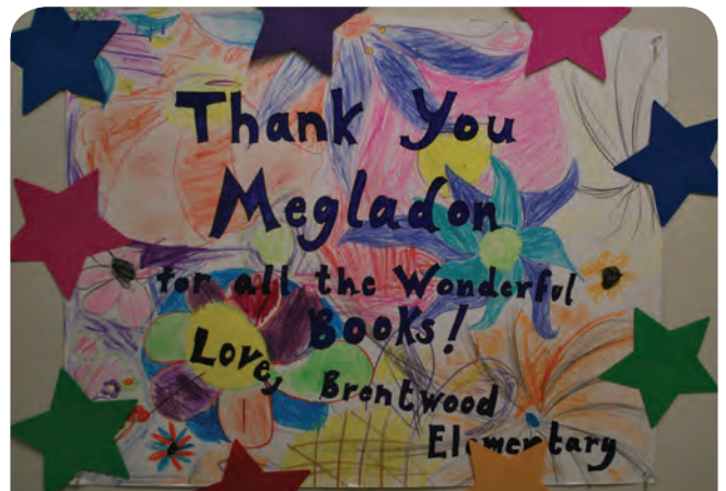
Megladon was named Brentwood Elementary's Partner of the Year.