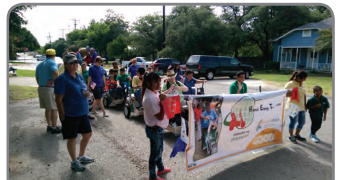
PET-Austin volunteers line up before the 4th of July Parade.