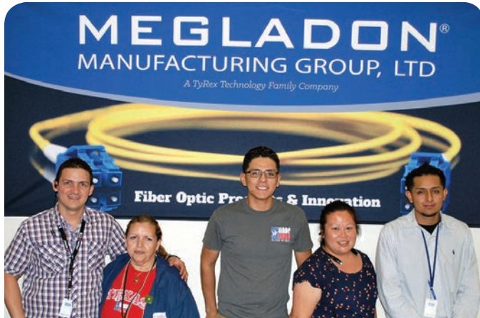
A big TyRex welcome to these new full-time Megladon employees!