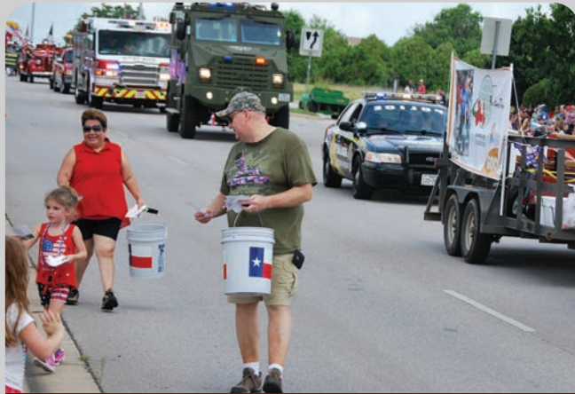
The PET-Austin float followed by Round Rock Fire and SWAT