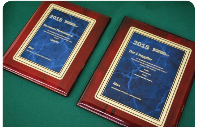
iRex receives two NI Supplier Appreciation Awards.