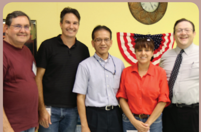
NI team members thank iRex for their fantastic work!