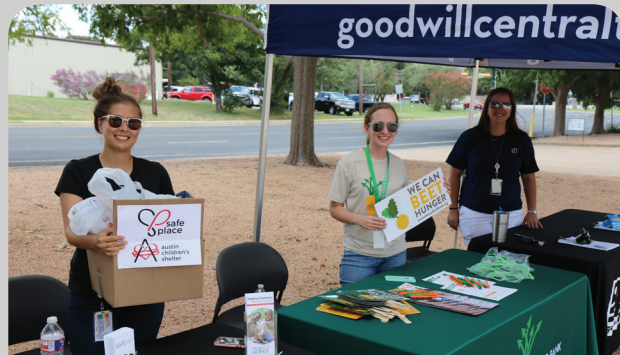
Goodwill, SAFE and Central Texas Food Bank bring in donations.