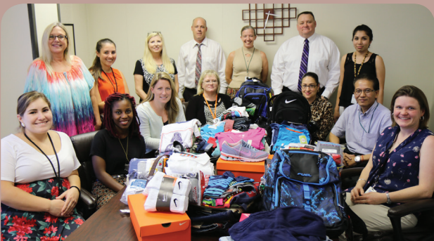
Teams getting things ready to deliver to their students