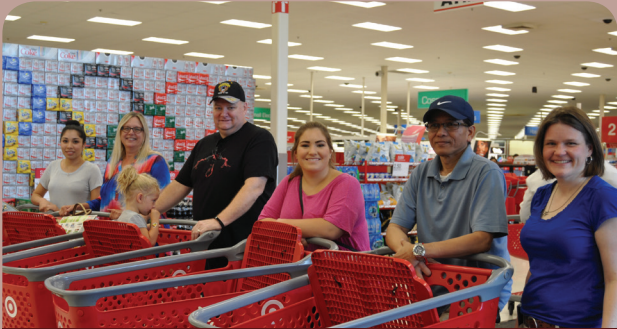
TyRex employees get ready to shop at Target.

Twenty TyRex Family members teamed up this year to send a group of kiddos in need back to school in style! Through a partnership with Tarrytown United Methodist Church, teams of two knocked out each student's back to school list. Teams took time out of their lunch breaks or weekend to hit the stores. Each team was assigned a specific student from ages 6 to 17 to buy five outfits and other school essentials. Thanks to everyone who supported this fun community service project!