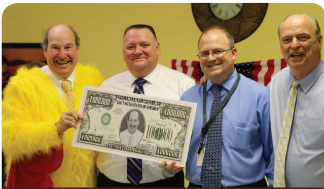
TyRex partners celebrate iRex's million dollar month!