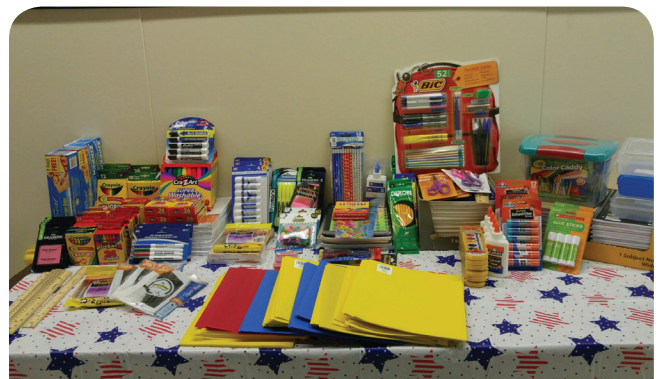
School supplies collected for students at Gause ISD.