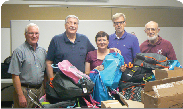
iRex and West Austin Rotary donated 50 backpacks for back to school!