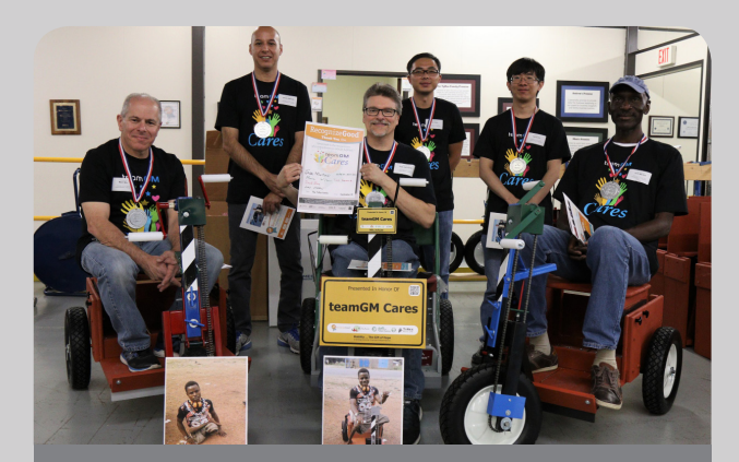
Volunteers from teamGM Cares showcasing their hard work