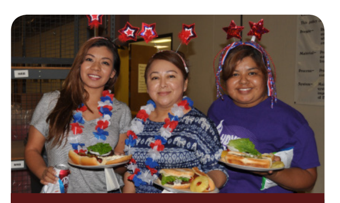
Employees were all smiles at TyRex's Fourth of July Celebration