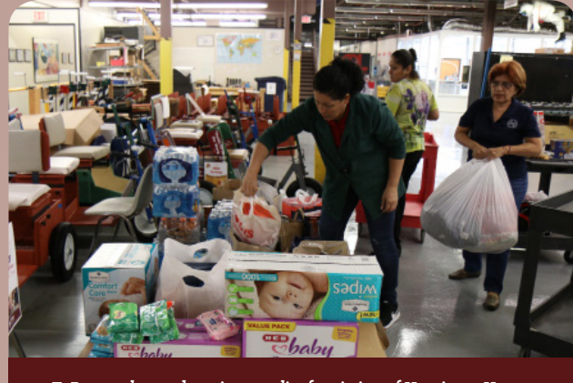
TyRex employees donating supplies for victims of Hurricane Harvey

We are very grateful for the opportunity to unite as a company in efforts to bring relief to our fellow Texans. Our sincere thoughts remain with those affected by the recent disasters around the country and the world.