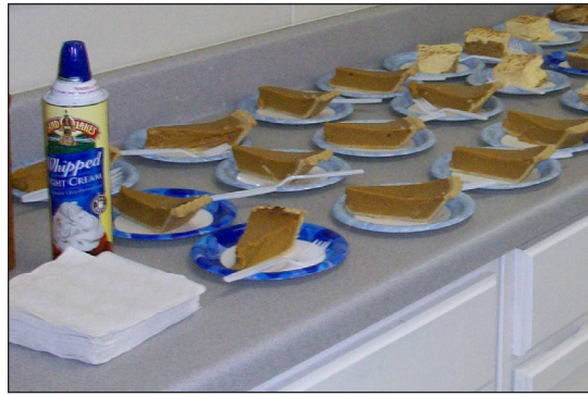
There was enough pumpkin pie for everyone at the TyRex Thanksgiving celebration.