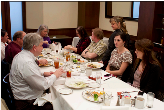
The Saber Data and RecognizeGood teams ate lunch together at City Grill on December 21.