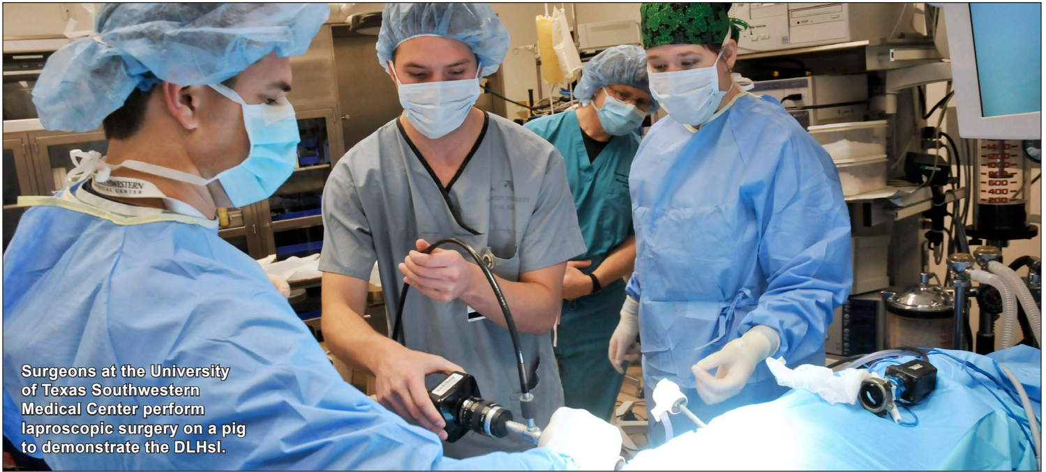
Surgeons at the University of Texas Southwestern Medical Center perform laproscopic surgery on a pig to demonstrate the DLHsl.