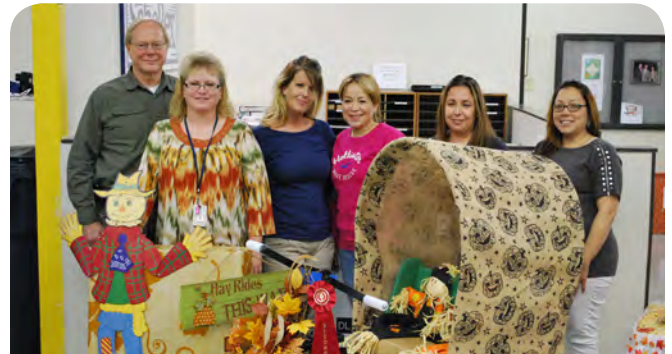
"The Turkey Trotters" from Megladon finished a close second.