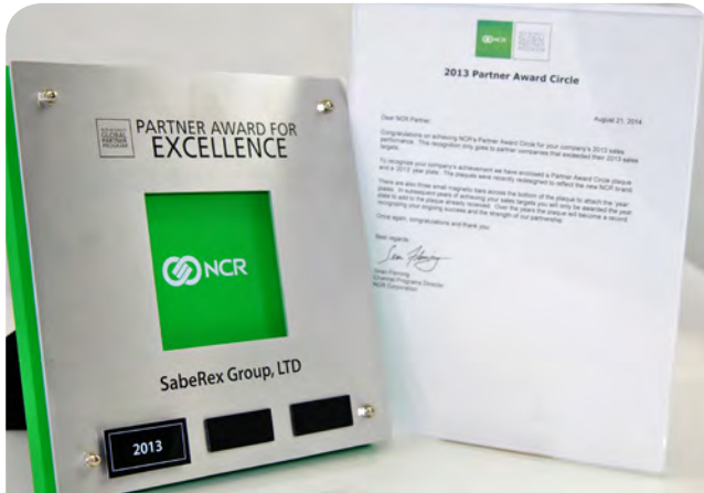
SabeRex received NCR's Partner Award for Excellence.