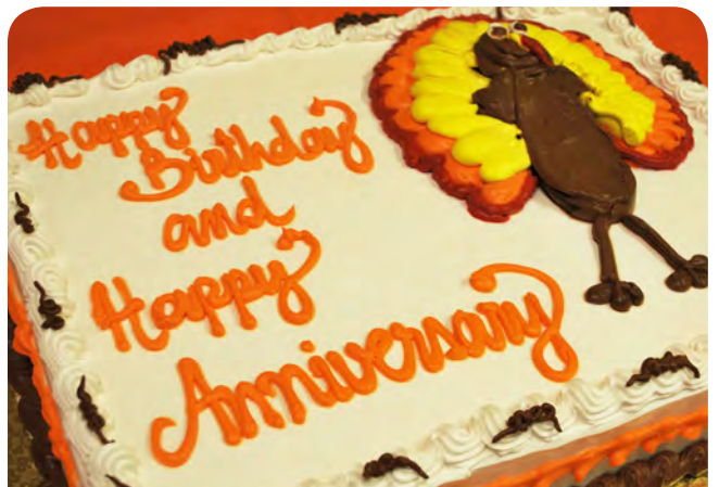
The cakes enjoyed during TyRex celebrations are never boring!