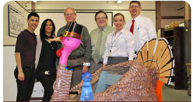
"The Soaring Innovators" from iRex with their first-place PET.