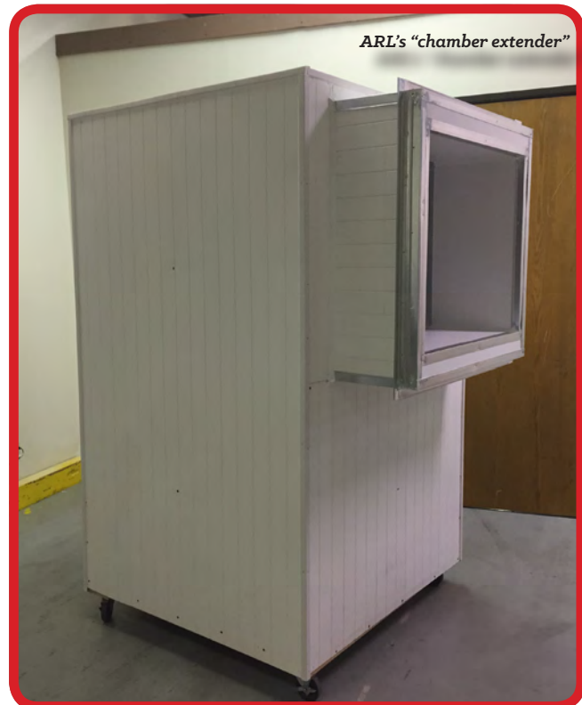
ARL's “chamber extender”