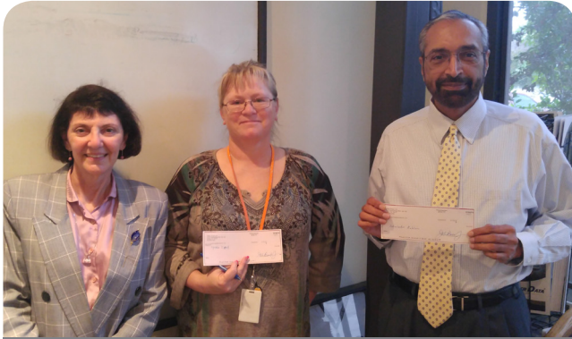
The TyRex Procurement Team reached their 300K cost savings goal!