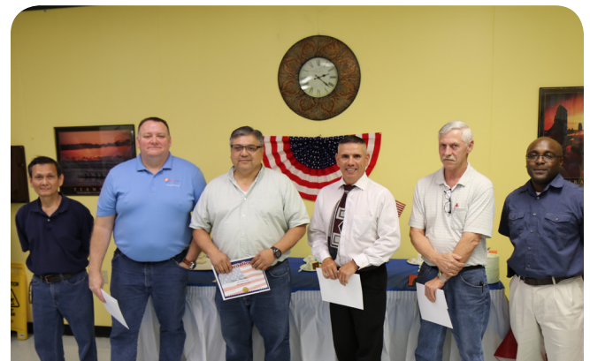
TyRex Family veterans receive special recognition for their service.