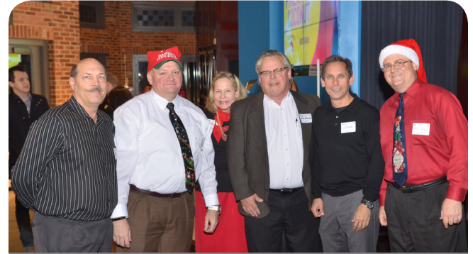
TyRex employees enjoy the holiday party and get ready for a great 2017!