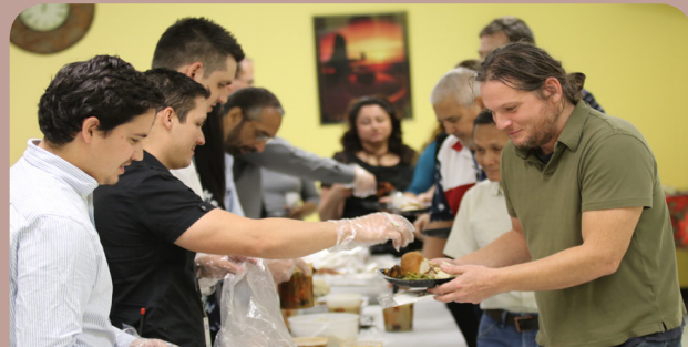
Employees enjoy a full Thanksgiving meal during our SAY THANKSgiving!