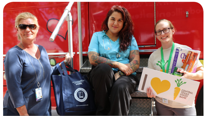
Our last Technology Blvd. Donation Day of the year was another huge success!