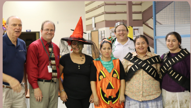
So many great costumes were displayed at the TyRex Halloween Lunch.