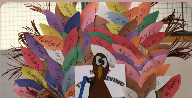
We have a lot to be thankful for at the TyRex Group!