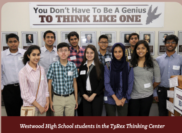
Westwood High School students in the TyRex Thinking Center