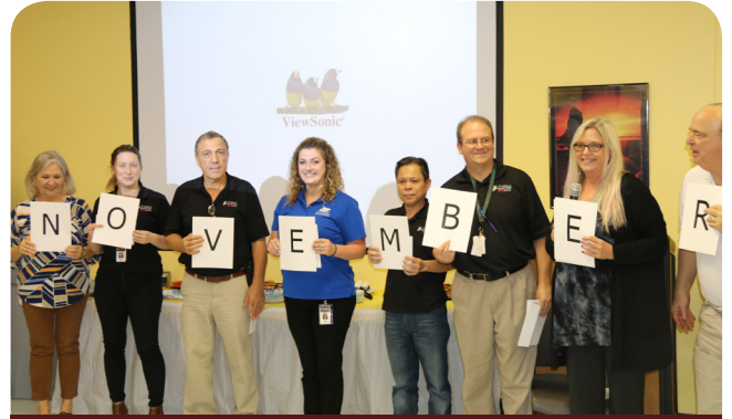
The TyRex family celebrating November Birthdays