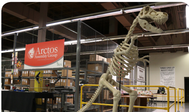
The newest addition to our facility - a giant T-Rex named REX