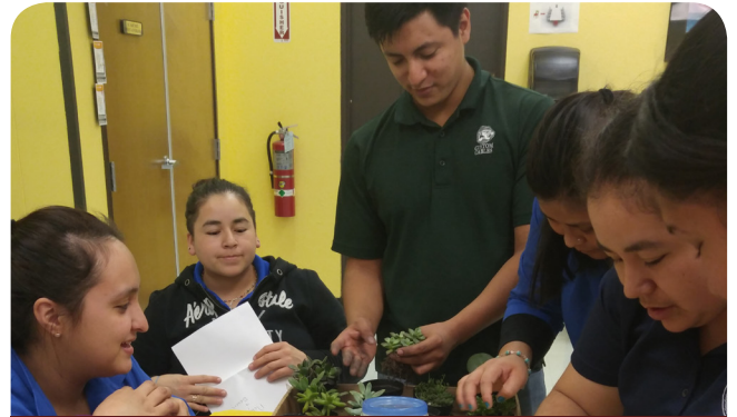
TyRex family members making Sand Lemonariums for TyRex Volunteer Row