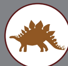
STG 4 Fronts