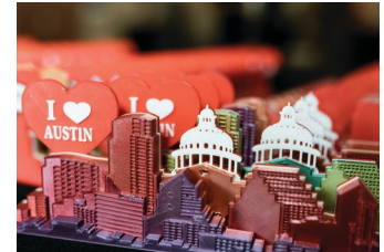
Rows of 3D printed Austin Skylines set up at TyRex's 3D printing booth.

Austin's business community continues to grow and thrive, due in large part to a rich talent pool and a pro-business environment overall. For those of us who are part of this business community, we know that Austin also has a certain culture that rings distinct from other business-friendly communities. Collaboration, putting people first, and subscribing to the idea that "doing the right thing is good business" are all part of Austin's unique success. As we continue to grow, keeping values like respect, integrity and honesty front of mind is more important than ever – and for the shining examples of businesses who do just that, it's equally important to celebrate.