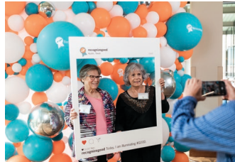
Ethics in Business Awards attendees posing for a picture.