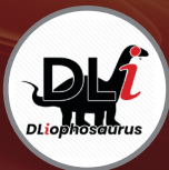
Digital Light Innovations