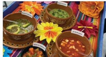
Salsa Competition Entries.

(All salsas were judged using 3D printed tortilla chips!)