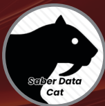
Saber Data Cat