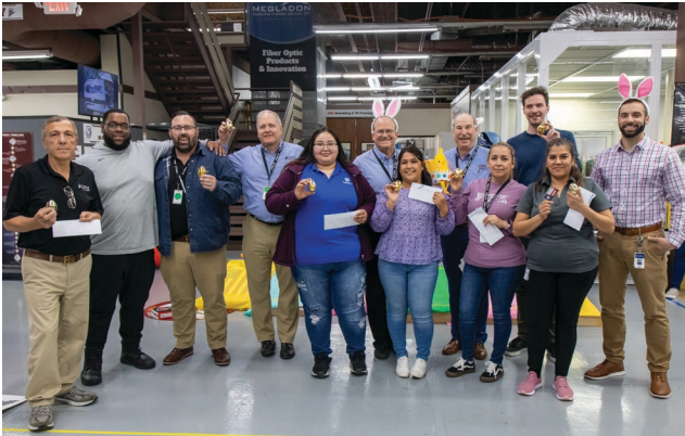
Congrats to our Egg Toss winners!

The weather may have been cold and rainy, but that didn't stop the TyRex Family from celebrating the Spring season with an altered version of our annual egg hunt - rather than filling baskets with found eggs, TyRex Family Members tossed their eggs into baskets in a unique contest of skill and vigor. In addition to that, we kept our annual tradition of decorating and assembling egg baskets - this year, we teamed up and donated a total of 200 baskets to our community partners the SAFE Alliance and Florence's Comfort House.