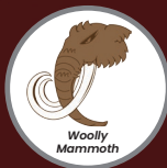
Woolly Mammoth 3D