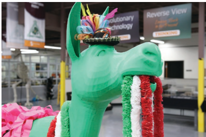
3D printed donkey piñata closeup.