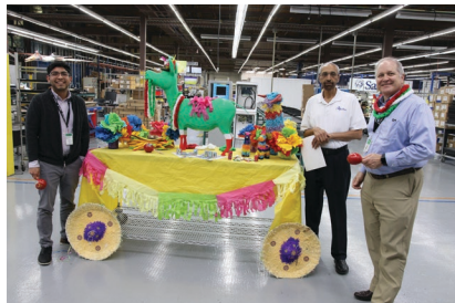
Cinco de Mayo event team with centerpiece/prize table.