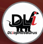
Digital Light Innovations