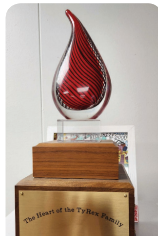
TyRex's Caring Heart Award