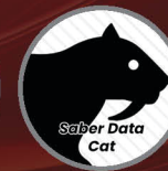
Saber Data Cat