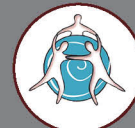
TyRex Learning Foundation