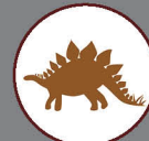
STG 4 Fronts