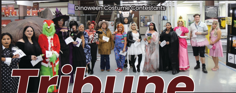
Halloween Costume Contestants