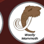
Woolly Mammoth 3D