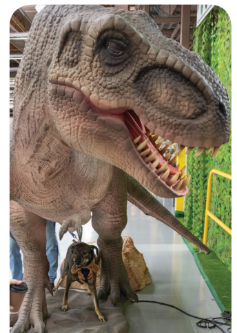
Atlas Rex and Rex