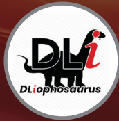
Digital Light Innovations