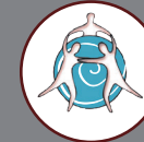
TyRex Learning Foundation