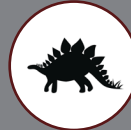
STG 4 Fronts